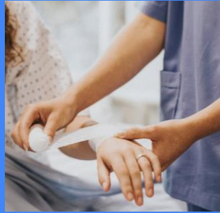
Service (CPT code)