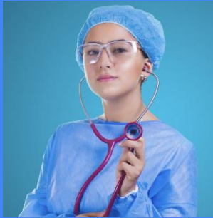
Provider (NPI #)